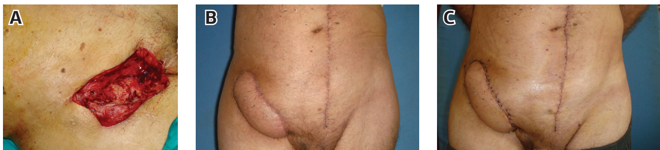
Figure 1. The appearance of the right inguinal soft-tissue defect after debridement (A). Appearance of the flap 10 days after the operation (B). Appearance of the patient 1 month after surgery. The flap survived completely, and the wound healed uneventfully (C).

completely and the patient was discharged ten days after the operation (Figure 1a,b). There were no complications at the first visit of the patient 1 month after surgery (Figure 1c). Lymphedema therapy with a pneumatic compression device was not performed throughout the postoperative hospitalization period, but it was resumed after discharge. Interestingly, two months after the operation, the patient was admitted to our department with complaints of swelling and redness due to the VRAM flap transfer (Figure 2a). When the patient was admitted to our department, complete blood count and wound culture were performed. White blood cell count was 6 \times 10^3/\mu\text{L} , and no bacterial colonization was isolated. Upon physical examination, flap skin was sloughed; the flap was firm, edematous and red. When the flap was palpated, there was no regional temperature increase, which was considered as a sign of infection. Furthermore, there was edema without godet sign. All of these signs led us to consider flap lymphedema. The presence of lower extremity lymphedema also supported our diagnosis. The sloughed skin was related to poor wound care on the patient's part and healed a few days later. To reduce flap lymphedema, extremity elevation, massage therapy and pneumatic compression therapy with increased intervals were recommended to the patient. During the follow-up period, flap lymphedema was significantly decreased, and the patient was satisfied with the results (Figure 2b).